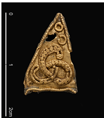
Fig. 4a. Fragment of a golden triangle-shaped foil from Ostrów Lednicki

One of the above-mentioned triquetras found in Poland may be placed into a clearly pagan context. This is the triangle-shaped piece of gold found on Ostrów Lednicki (Fig. 4a), which has very good parallels in Scandinavian artefacts which include decorated Thor's hammers 7 . A similar connotation was guessed by the founder of a bronze «capsule» decorated with two knot triquetras (Fig. 4b). This artefact excavated in Janów Pomorski where the Scandinavian emporium Truso had been located in the tenth century, was interpreted as «an amulet referring to the Scandinavian mythology» 8 .