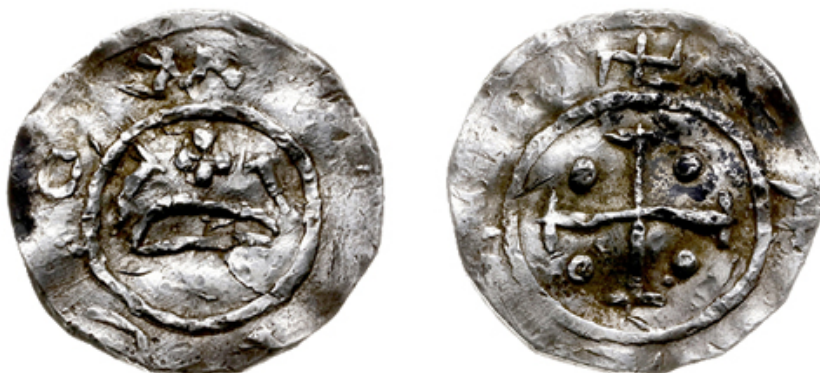
Fig. 1. The last coin issued by Boleslav Chrobry

process was certainly long and difficult, with old traditions slowly giving way to elements of the new religion promoted by the ruler and the Church. Such a situation has not been specific for the Piast state. This long and difficult ideological struggle seems to be expressed in artistic symbolism which shows a visible degree of syncretism, with old and new elements challenging each other or taking on new meanings.