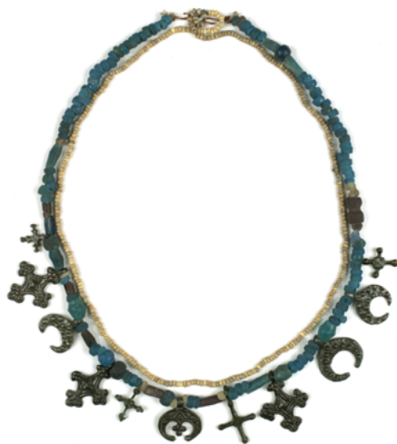
Fig. 7. A «syncretic» necklace from Daniłowo Małe

Another creative use of the main Christian symbol is represented by the so-called «Hiddensee» cross-like pendants, four fragments of which have been discovered in four Polish localities. Despite their Christian appearance, they are suspected to have functioned within a pagan or syncretic context 12 . This is convincingly proved by a necklace discovered in 2008 in an eleventh century- grave of a women buried in Dziekanowice, near the above mentioned Ostrów Lednicki Island 13 . This necklace consisted of a silver Hiddensee-type cross pendant and 16 apotropaic box-reliquaries containing various plants meant to protect their owner (Fig. 6).