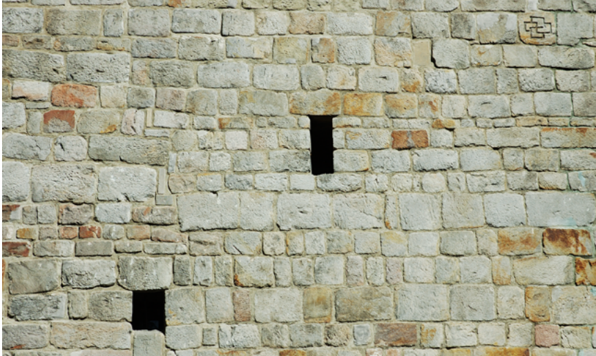
Fig. 2. Developed version of a swastika visible in the wall of the Kruszwica basilica

Both versions of a swastika may be found at bottoms of numerous clay vessels produced in Poland by Early Medieval potters. They belong to the wide range of various signs commonly used in potters' workshops to identify their production 1 . This allows to guess that these two signs functioned much wider in the Mediaeval society than just among the elite, which was at the forefront of the ideological contest. How much was it an appeal to the symbolism of the «old» faith remains unknown.