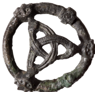
Fig. 4b. Bronze artefact ornamented with a triquetra excavated in Truso (Janów Pomorski)