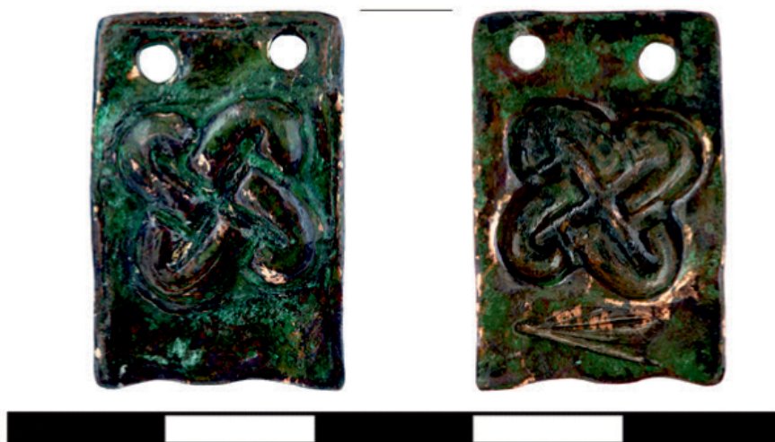
Fig. 3a. The so called «Salomon's knots» in bronze discovered in Chodilik, region of Karczmiska