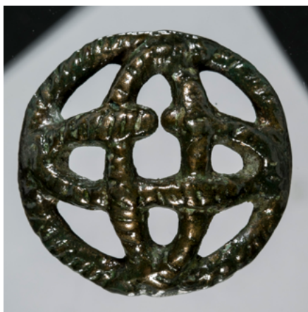
Fig. 3b. Badge from Czermno, stored at the Janusz Peter Regional Museum in Tomaszów Lubelski

A simpler version of the ancient solar symbol is the three-armed swastika also known as triquetra or triskelion , which is also visible among the above-mentioned potters' marks. Especially interesting for our discussion is the Irish(?) triquetra developed into a form of a three-looped knot. It is sometimes called the «Trinity knot», because like the St Patrick's three-leafed shamrock, it could have been used as a pictorial expression of the perpetual nature of the Holy Trinity. This symbol may be easily found on jewelry, monumental High Crosses and in books – e.g. the most famous Book of Kells made in the ninth century 3 .